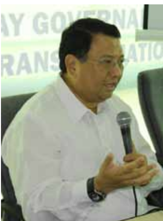
DOE Sec. Jose Rene Almendras

Despite the bleak outlook of the crippling power crisis that has gripped parts of the country specially in Mindanao, Energy Secretary Jose Rene Almendras painted a rosy picture of the future of the nation's energy sustainability.