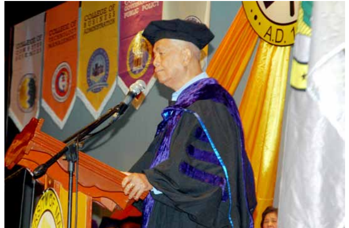
Prof. Nene Pimentel delivers an inspirational message for the city and municipal councilors graduating from the CGPP Executive Program. (June 30)