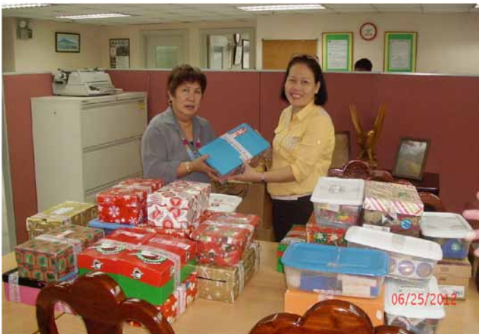
LAUNCHING OF UMAK-CESELE AND INTERNATIONAL BAPTIST CHURCH LITERACY TRAINING PROGRAM: READING AND WRITING SESSIONS FOR THE FORTY (40) CHILDREN OF BARANGAY DAMAYAN, FLOODWAY-