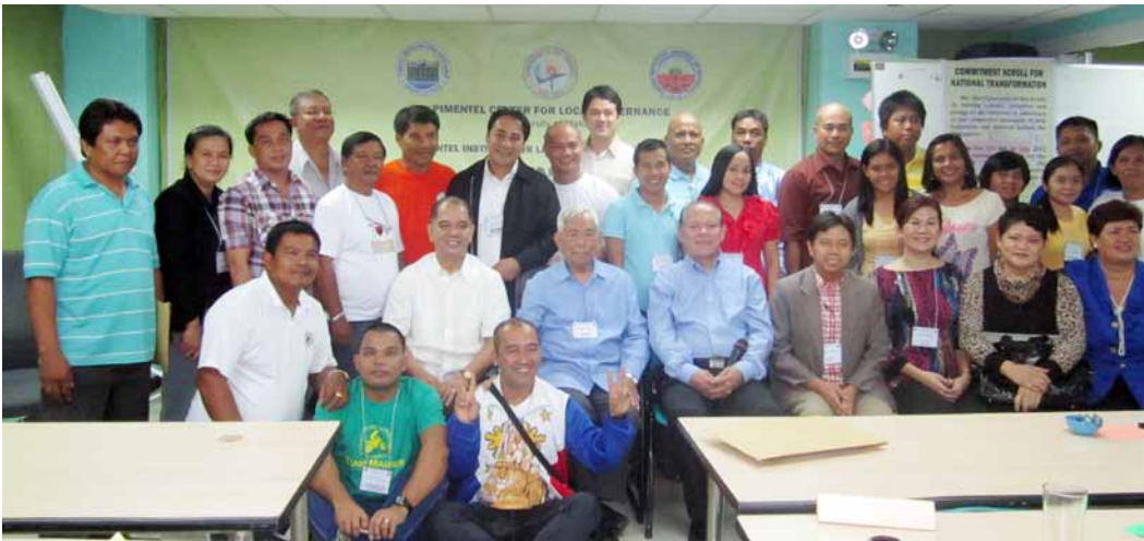
Participants and lecturers of the July 20-21 seminar for local government officials conducted by the Center.

The Department of Interior and Local Government has endorsed the barangay seminars conducted by the Pimentel Institute for Leadership and Governance (PILG), in conjunction with the Pimentel Center for Local Governance (PCLG), which aim to enhance the knowhow, skills and competence of those serving the frontlines of public service.