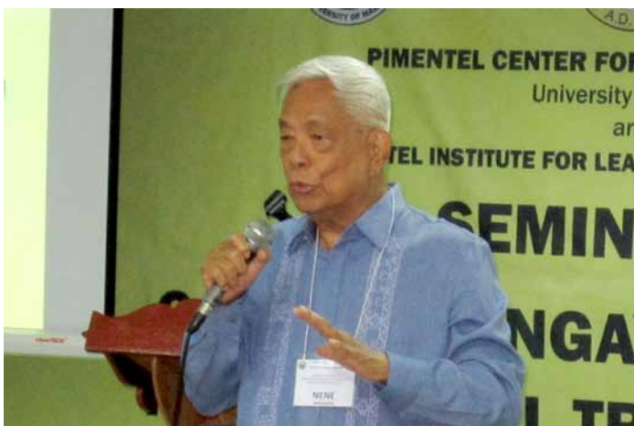
Prof. Nene Pimentel

As a student of public administration and governance, based on our own studies we have come to the conclusion that reform efforts towards the elusive goal of development and transformation should be targeted at the following areas: reform institutions, structures and processes; and reform paradigms, mindsets and even values . However, these have to be reinforced by a committed and transformed leadership and