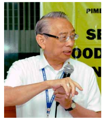
Archbishop Oscar Cruz

The PILG also has featured roundtable discussions as part of its continuing advocacy for