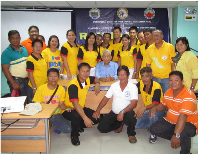
Visiting barangay officials from Banga, Province of Aklan. (February 26)