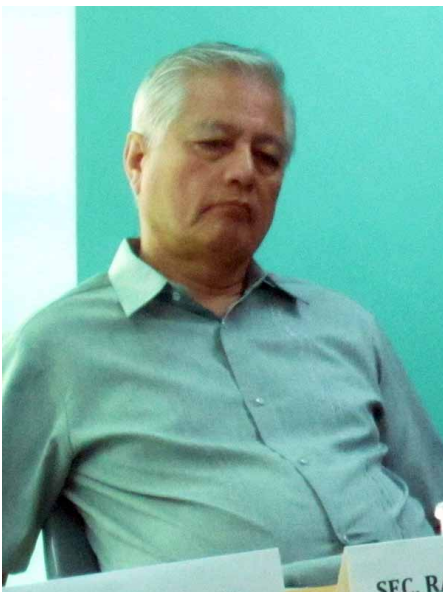
Resource Speakers: Sec. Rafael Alunan

All the inputs of the experts gathered during the roundtable discussion will be processed to be incorporated in a theme paper for the UNDP the Future of Governance.