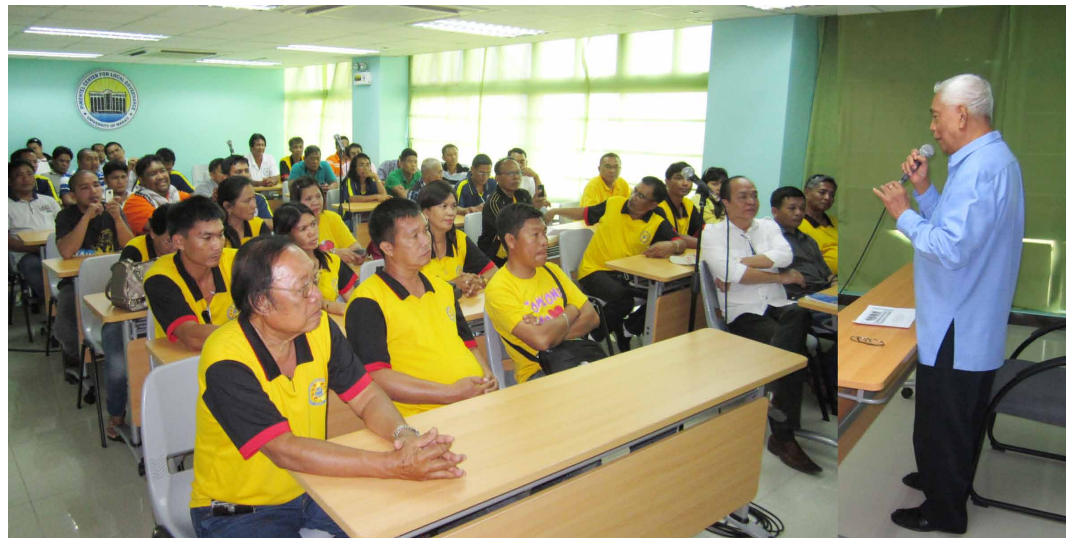
Prof. Nene Pimentel, Jr. reminds barangay leaders from Aklan that their principal role as barangay leaders is to be frontline public servants in the delivery of the basic needs of the people as they are government officials who are directly in contact with their constituents. (February 26)

The barangay leaders from Aklan embarked on a three day learning trip to Manila traveling from Caticlan to the island province of Mindoro, to Batangas