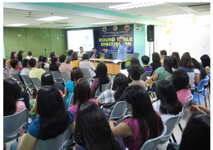
Prof. Nene Pimentel speaks on the topic of Good Governance and Effective Leadership for National Transformation to the officials and graduate students of Pampanga Agricultural College during their visit at the Pimentel Center. (February 27)