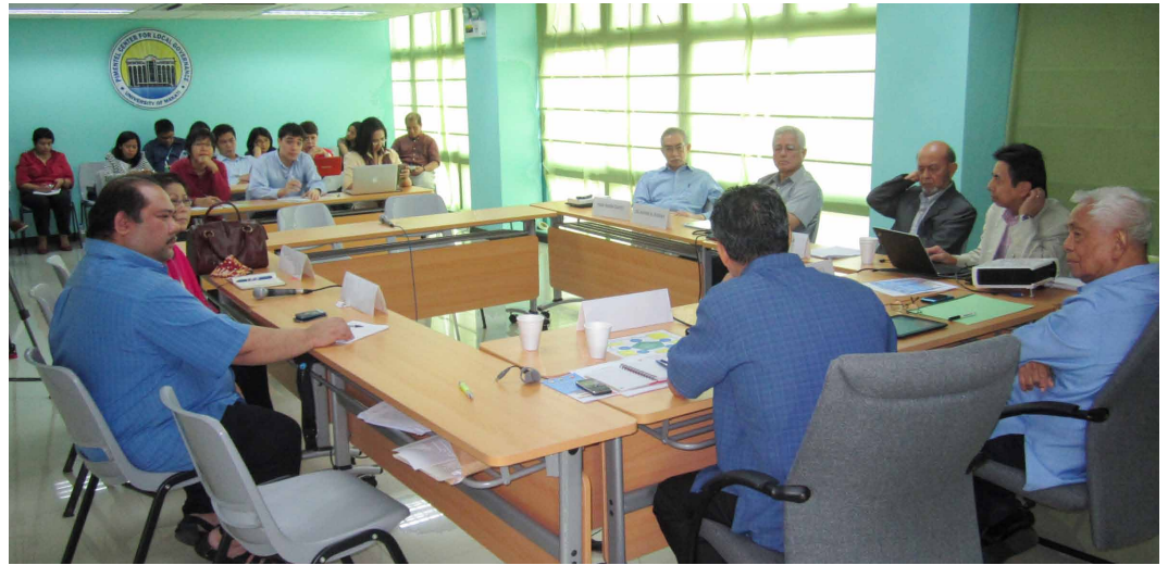
A roundtable discussion on the future of governance in the Philippines gathers some of the best political minds consisting of members of the academe and former high ranking officials in government at the Pimentel Institute for Leadership and Governance. The forum was convened upon initiative of the UNDP as part of its overall effort to prepare a theme paper on the Future of Governance.(February 28)