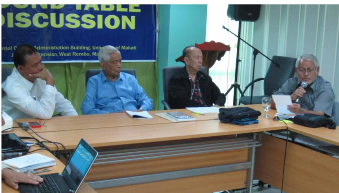
Former Sulu Governor Tilah also discusses about the issues on the claim of Sultan of Sulu in North Borneo (Sabah).

He said those engaged in human trafficking should be dealt with the full force of the law, and be meted the penalties imposed by law so as to deter the proliferation of such criminal syndicates.