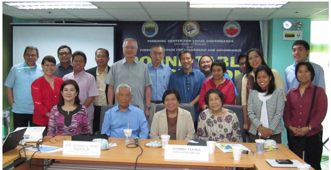
Experts from the academe and former government officials aired their thoughts and sentiments on the future of governance in the Philippines, in the hope of making government responsive and relevant to the needs of the people. (February 28)

In our country, the main problem is neither populism of government, nor technocracy, but the rather the lack of proper insulation of our governance institutions from politi-