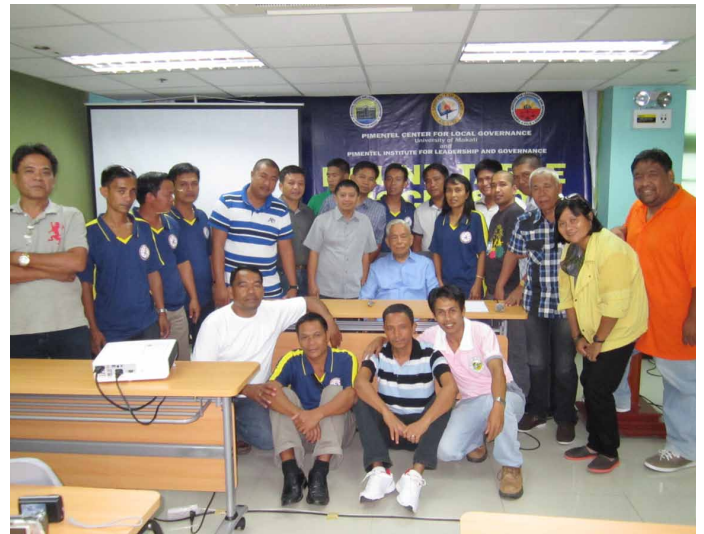
Visiting barangay officials from Madalag and New Washington, Province of Aklan. (February 26)