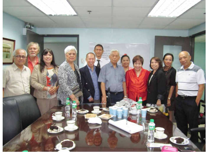
Meeting with overseas Filipinos from Australia, the U.S and the Middle East. (February 22)