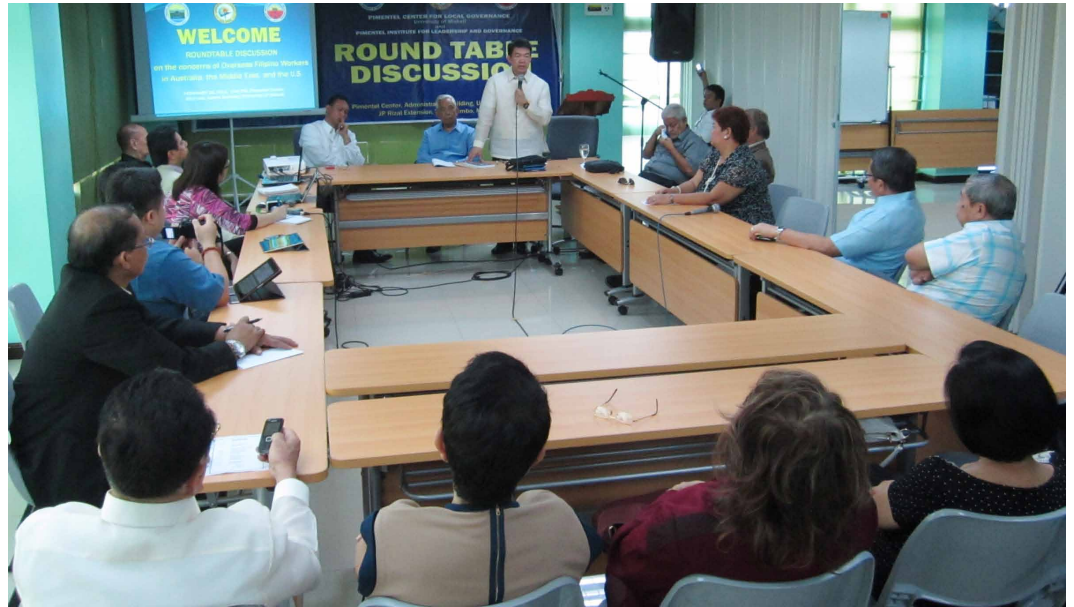
Senator Aquilino Koko Pimentel III, speaks during a roundtable discussion on OFW concerns, expressing his views on how to improve the lives of Filipinos working abroad. The welfare of OFW is one of the main advocacies of Senator Pimentel as Senator, where he has sponsored legislative measures protecting and promoting the interests of Filipinos abroad. He has worked to involve overseas Filipinos in the political affairs of governments by making it easier for OFWs to vote during elections. (February 28)

Under Senate Bill No. 3312, applicants who have