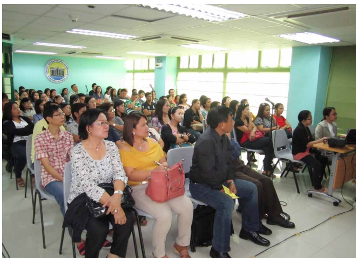
Pictures with the officials and graduate students of Pampanga Agricultural College. (February 27).

He explained that in order to be good citizens, people must obey the law, respect the rights of others, and exercise the rights of citizenship, like paying the correct taxes, or perform public service.