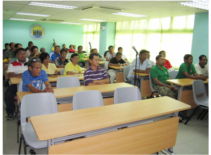
Visiting barangay officials from Municipality of Malinao, Lago and Tangalan, Province of Aklan. (March 6)