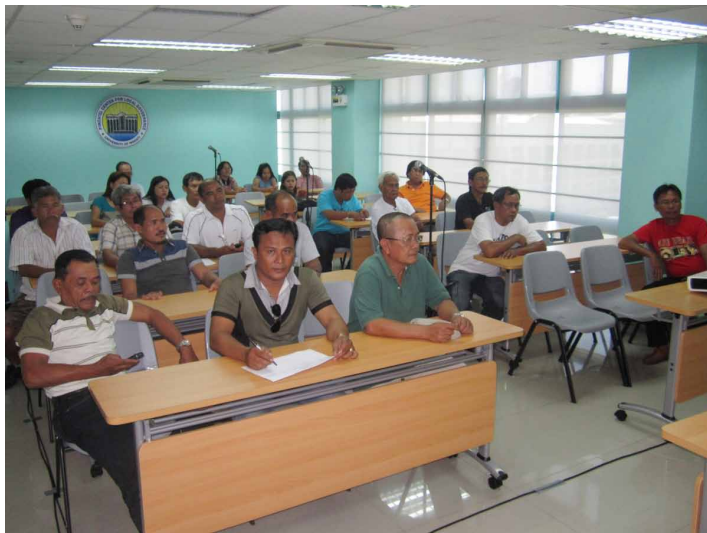
Visiting barangay officials from Municipality of Kalibo and Makato, Province of Aklan. (March 20)