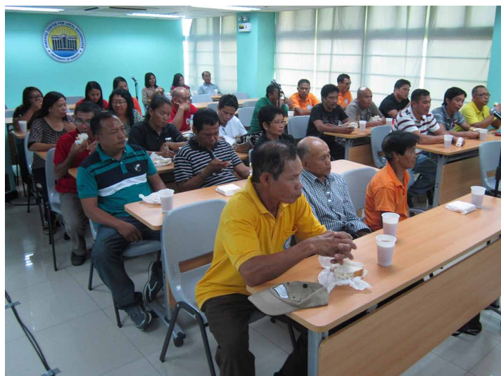
Visiting barangay officials from Municipality of Libaco, Province of Aklan. (March 27)