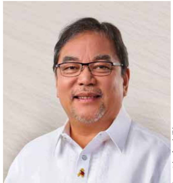
DOT Secretary Ramon R. Jimenez, JR.

During their academic tenure the participants learn first hand from the experts in the field, like former Senator Aquilino Nene