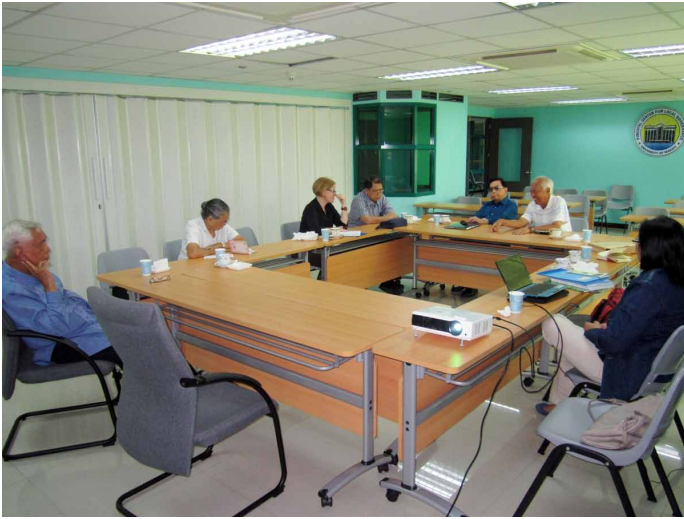
Climate change committee regular meeting. (March 6)