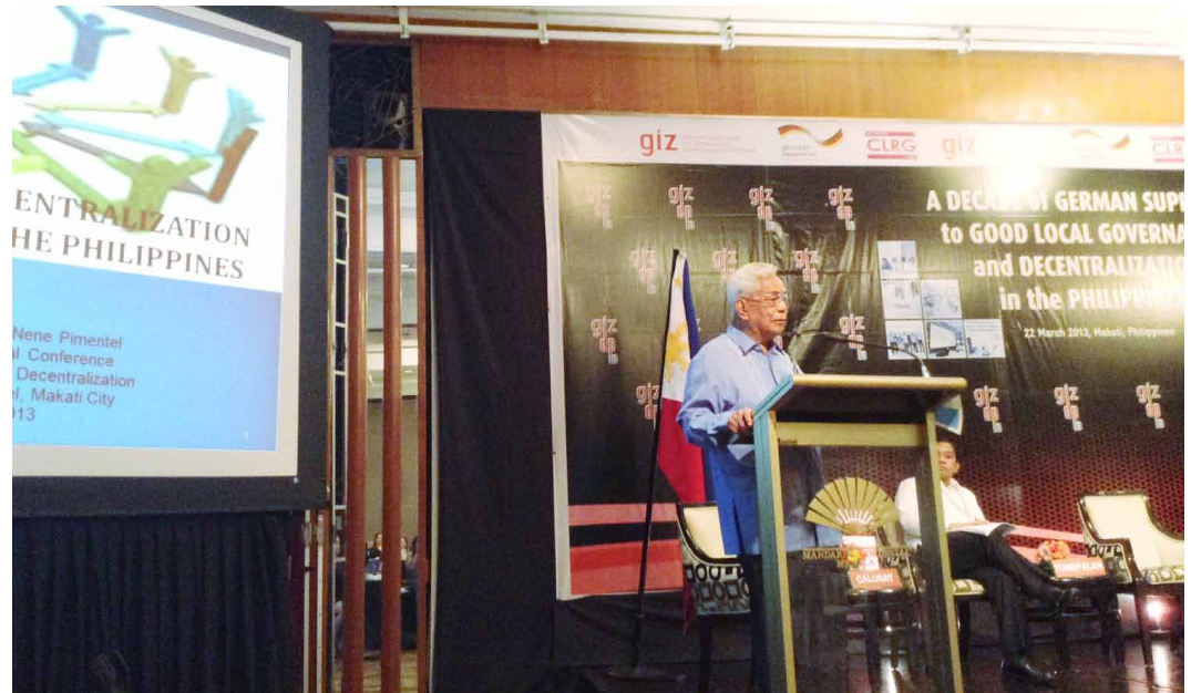
Prof. Nene Pimentel of the Pimentel Institute for Leadership and Governance (PILG) cited the contributions of the German Development Cooperation in strengthening local government and decentralization in the Philippines, when he keynoted it international conference last March 22.

As Senator in 1991, Pimentel steered the pas-