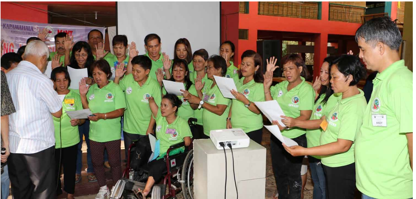
Kapamahala Peoples Council Officers take their Oaths of office before Prof. Nene Pimentel.