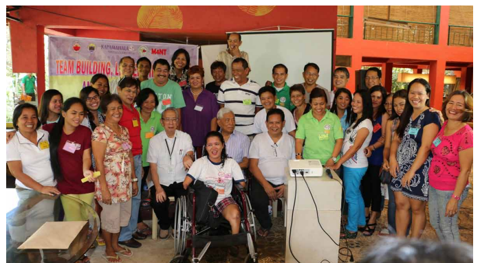
Participants pose with Archbishop Oscar Cruz and Prof. Nene Pimentel.