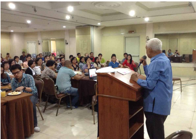
Nene Pimentel discusses Good Governance with the participants of the Personnel Officers Association of the Philippines at Hotel Veniz, Baguio City (May 16).