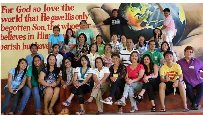
Participants of the seminar pose after the morning exercise.