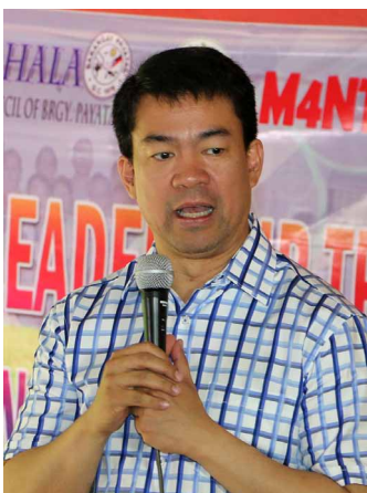
Senator Koko Pimentel

Ending the activity was the awarding of certificates and the signing of the commitment scroll by the participants, KPC officers and Payatas barangay officials.