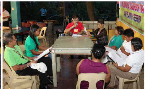
The participants divided into five groups for the role playing on how to conduct meetings and practice the parliamentary rules and procedures.