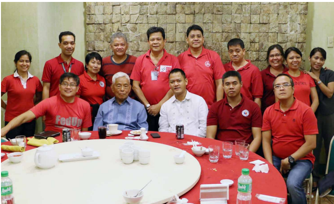
Officers of different government employees' groups converge at the Emerald Restaurant after filing their petition in the Supreme Court (August 6).