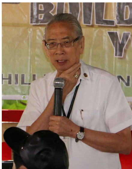
Archbishop Oscar Cruz