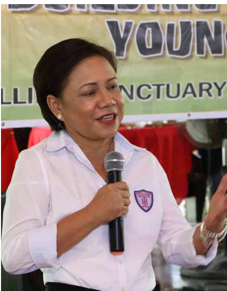
Senator Cynthia Villar