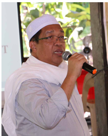
MSU President Macapado Muslim

Teambuilding activities were conducted in the afternoon, culminating in a breakout session where participants engaged in an